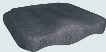
Curera® Contur Seat Cushion with standard cover

Contur has a waterproof surface that prevents liquids from passing through and is easy to clean. The cushion comes with a durable cover in grey polyester plush with high friction. None of Curera® seat cushions and covers contains any bromide-based flame retardants or latex.