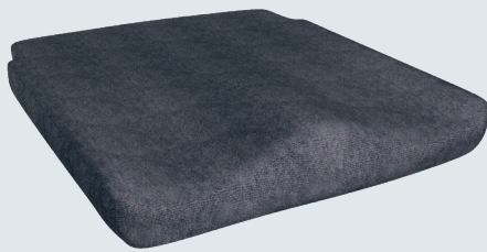
Curera® Consept Seat Cushion with standard cover

A liquid proof and vapour permeable cover that is elastic and flexible with an anti-slip underside.