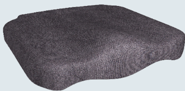
Curera® Contur Seat Cushion with standard cover

Contur has a waterproof surface that prevents liquids from passing through and is easy to clean. The cushion comes with a durable cover in grey polyester plush with high friction. None of Curera® seat cushions and covers contains any bromide-based flame retardants or latex.