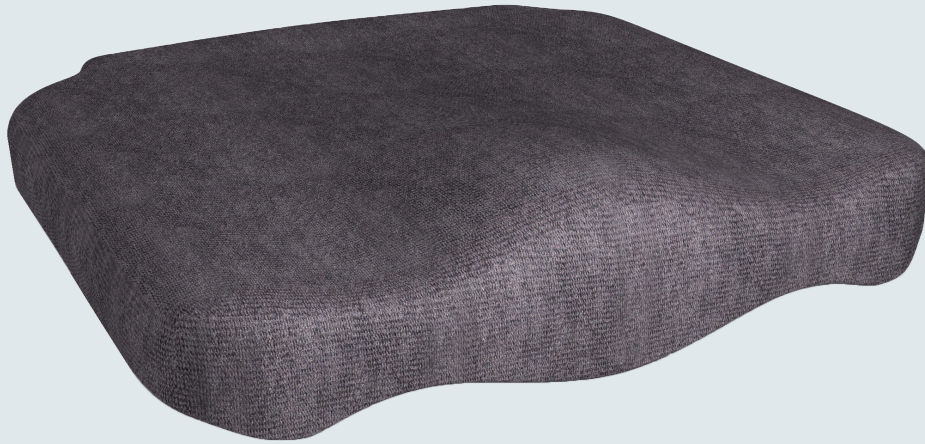
Curera ® Contur Seat Cushion with Standard Cover