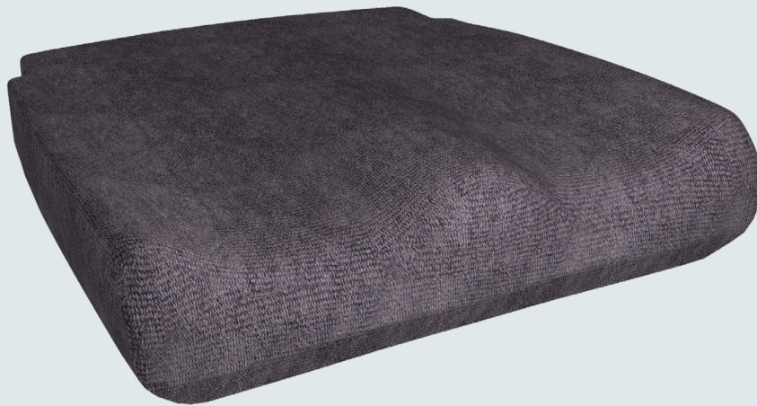
Curera ® Tremix with Standard Cover

Comfortable pressure prevention seat cushion