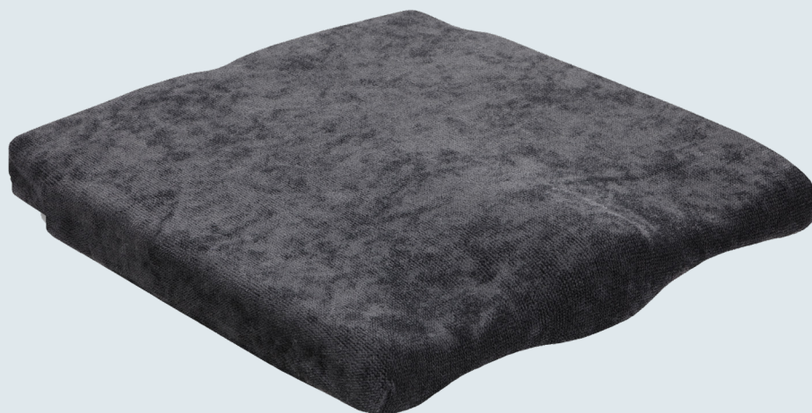
Curera ® Hemi Seat Cushion with Standard Cover