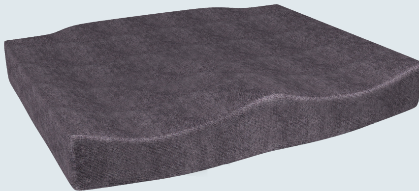
Curera® Consil Seat Cushion with Standard Cover