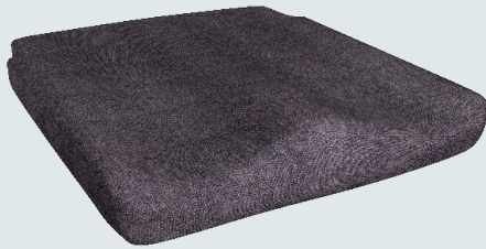
Curera® Consept Seat Cushion with standard cover

A liquid proof and vapour permeable cover that is elastic and flexible with an anti-slip underside.