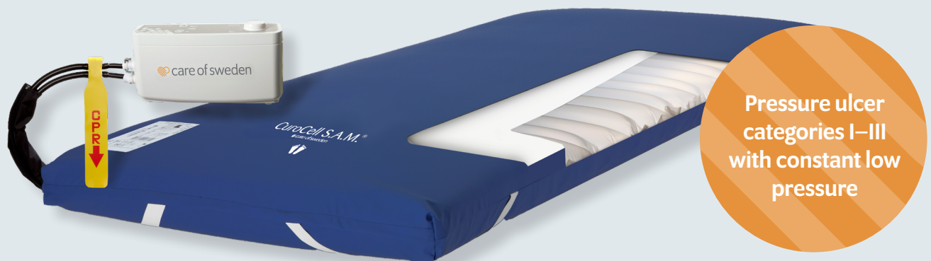
CuroCell S.A.M.® PRO CF10

Thanks to our continuous development efforts, conducted in collaboration with healthcare professionals and users, we have developed a system for the CuroCell S.A.M.® -series based on the need to equalise pressure in different situations: low noise level, user comfort and ease of use.