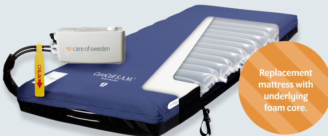
CuroCell S.A.M.® PRO CF16