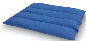
Curera® Multi Pillow

Positioning the affected limbs can aid in increasing comfort, awareness and help protect from pressure.