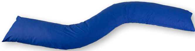
Curera® S-Shaped pillow

The 30° side lying is commonly used to provide pressure relief to immobilized users. For users unable to lie in prone positions, a supported semi-prone position can be used as an alternative.