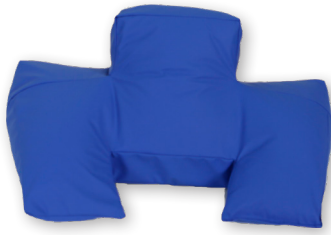
Curera® Abduction Pillow