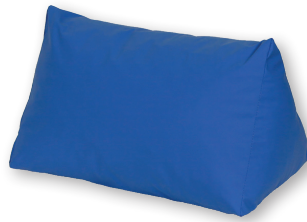
Curera® Triangle Pillow

Many users have limited mobility in various joints and/or muscle groups. Accommodating for this with positioning pillows will increase pressure redistribution and aid in maintaining comfortable and stable positions.