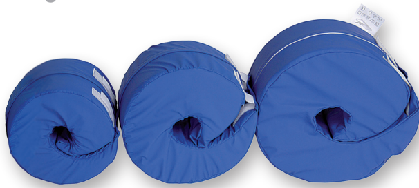
Curera ® Molly Heel Protector

Heels are especially vulnerable to skin breakdown, often requiring total pressure relief that is also comfortable.