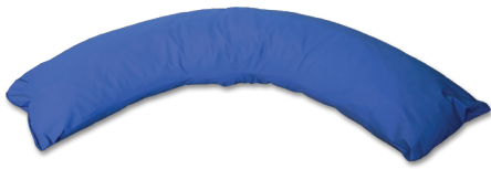
Curera® Curved Pillow

Use of positioning pillows to support half sitting in bed, allows users to be more active while protecting skin integrity.