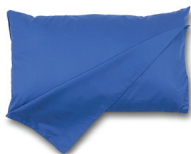
Curera® Back Support Pillow