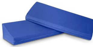
Curera® Support Wedge

A 30° side lying position is used as a means of relieving pressure. The semi-prone position may also aid in supporting respiration.