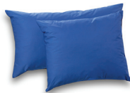
Curera® Rectangular Pillow