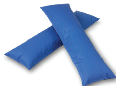
Curera® Rectangular Pillow