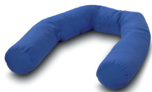
Curera® Positioning Roll