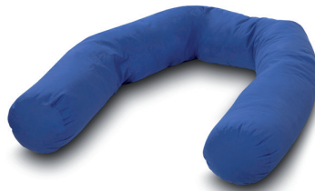
Curera® Positioning Roll