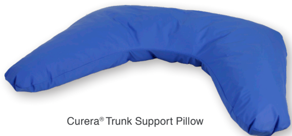
Curera ® Trunk Support Pillow

One of the first steps towards mobilization is bedside sitting. Positioning Pillows can offer solutions to increase stability to this end.