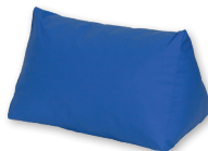
Curera® Triangle Pillow