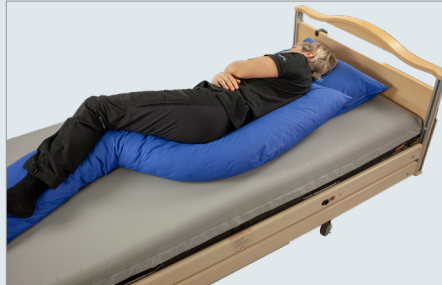
30° position for pressure relief