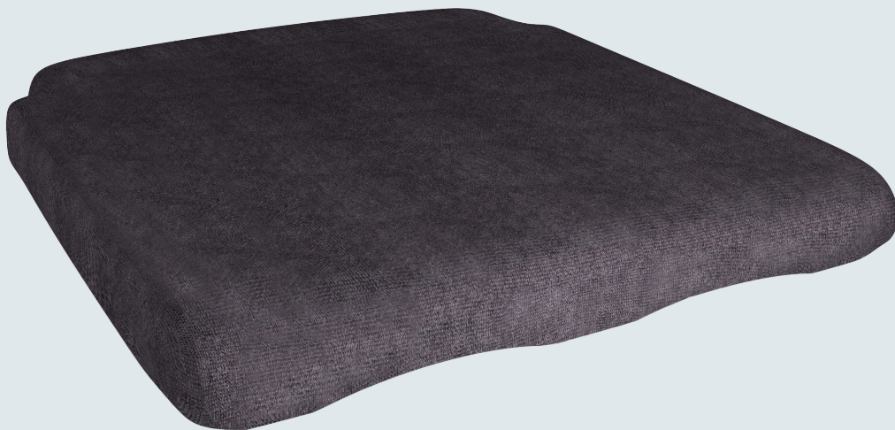
Curera ® Plantur Seat Cushion with Standard Cover