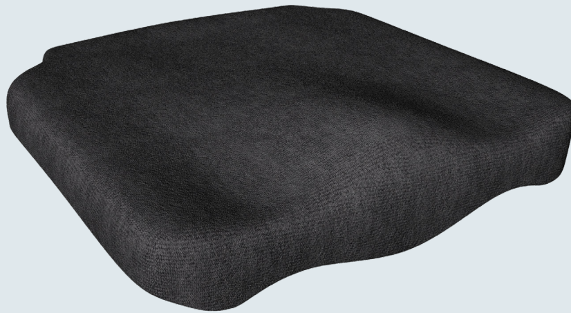
Curera ® Contur Seat Cushion with Standard Cover