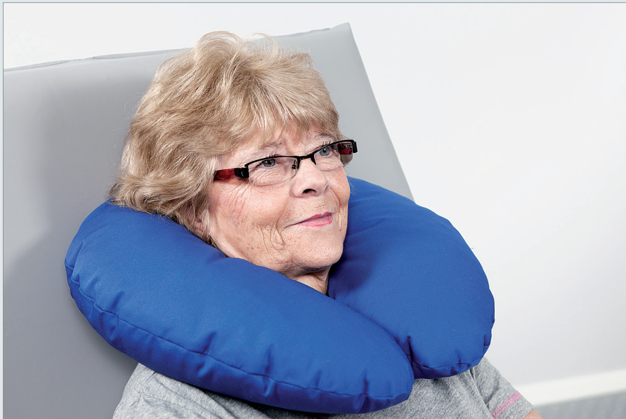
PRESSURE RELIEF, SUPPORT AND POSITIONING OF HEAD/NECK.