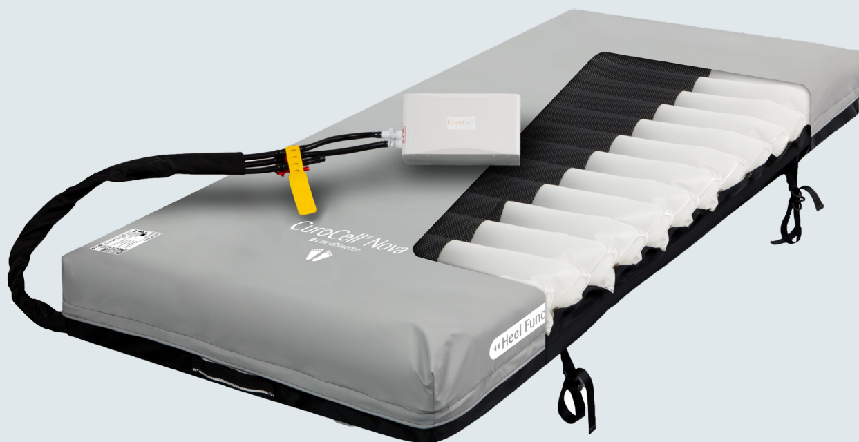
CuroCell® Nova CX19 with cover Olivia

Dynamic pressure care mattress replacement system